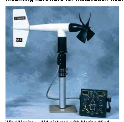
Wind Monitor – MA pictured with Marine Wind Tracker display.

For specific applications, separate signal conditioning devices are available. Model 05603C Wind Sensor Interface offers calibrated 0-5VDC outputs for wind speed and wind direction. Model 05631C Wind Line Driver provides calibrated 4-20 mA current signals for each channel, useful in high noise areas or for long cables of up to several kilometers. Each interface circuit is supplied in a weatherproof junction box with mounting hardware for installation near the sensor.