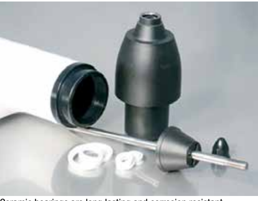
Ceramic bearings are long lasting and corrosion resistant.