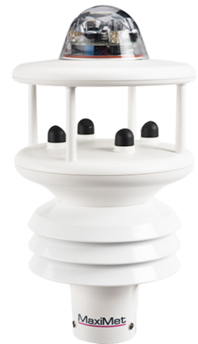
MaxiMet GMX600 measures 6 parameters including precipitation.