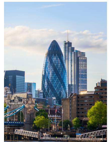
MaxiMet compact weather stations are integrated into systems monitoring gas and particulate concentrations in the air.