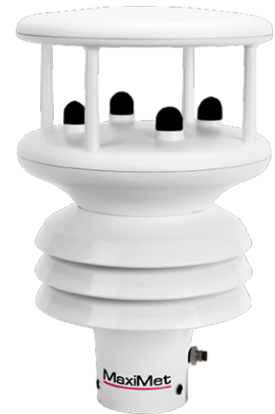
MaxiMet GMX550 measures 6 parameters including precipitation